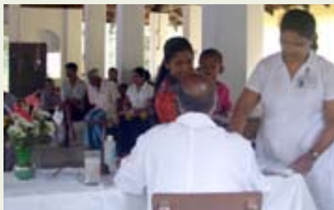
People being treated at a clinic